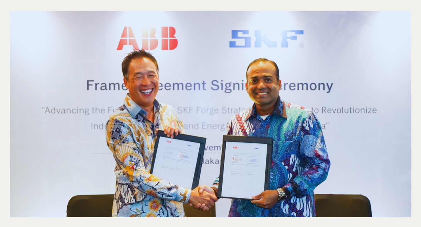
ABB INDONESIA and SKF INDUSTRIAL INDONESIA collaborate to deliver cuttingedge industrial automation solutions, elevate customer support, and advance energy efficiency in Indonesia's key industries. This partnership focuses on enhancing productivity and sustainability in key sectors, including power generation, mining, cement, petrochemicals, oil and gas, and rail transportation sectors.