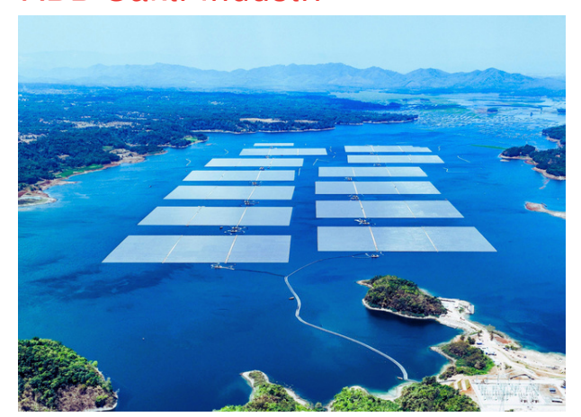
ABB has delivered a state-of-the-art distribution solution to ensure Southeast Asia's largest floating solar power plant can deliver reliable, clean energy to 50,000 Indonesian homes. The new 250-hectare floating solar power plant in the Cirata Reservoir will avoid more than 200,000 tons of carbon dioxide emissions annually. The reliability of electricity supply is ensured with ABB's UniGear ZS1 medium-voltage switchgear equipped with Relion® protection relays.

ABB recognized once again by Indonesian state-owned utility company PLN as "Best Provider" for its high-performance, locally manufactured MCB (miniature circuit breaker). For the past two decades, ABB has a proven track record as a PLN supplier for MCB, with outstanding quality and unmatched production capacity.