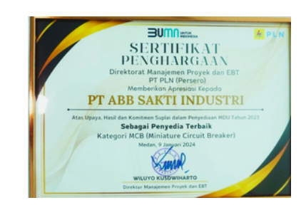
ABB recognized once again by Indonesian state-owned utility company PLN as "Best Provider" for its high-performance, locally manufactured MCB (miniature circuit breaker). For the past two decades, ABB has a proven track record as a PLN supplier for MCB, with outstanding quality and unmatched production capacity.

ABB has delivered a state-of-the-art distribution solution to ensure Southeast Asia's largest floating solar power plant can deliver reliable, clean energy to 50,000 Indonesian homes. The new 250-hectare floating solar power plant in the Cirata Reservoir will avoid more than 200,000 tons of carbon dioxide emissions annually. The reliability of electricity supply is ensured with ABB's UniGear ZS1 medium-voltage switchgear equipped with Relion® protection relays.